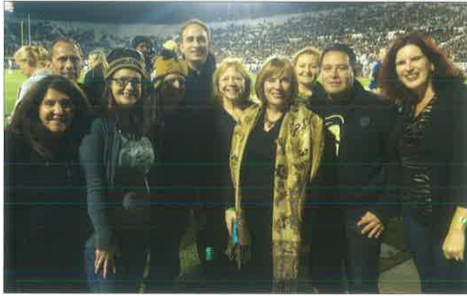
CARE volunteers with the Central Florida Bankruptcy Law Association were invited onto the football field during the University of Central Florida in November and were recognized as the Community Partner of the Game.

placed 17 volunteers who contributed more than 63 hours of classroom instructional time. Through these efforts, more than 1,500 local students received valuable financial literacy instruction on topics such as identity theft, responsible credit card use and paying for post-secondary education. In recognition, CFBLA CARE volunteers were invited on the football field on Nov. 14 to be recognized by the University of Central Florida as the Community Partner of the Game, and on Feb. 18, the School Board of Orange County recognized CFBLA CARE for its efforts in bringing financial literacy education to local youth.