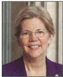
Sen. Elizabeth Warren

Sen. Elizabeth Warren (D-Mass.) will address those attending the opening session of the 33rd Annual Spring Meeting in Washington, D.C., on the evening of April 16. Sen. Warren, a long-time ABI member while a bankruptcy professor at Harvard and other law schools, is serving her first term as the state's senior senator. She previously served as the reporter for the National Bankruptcy Review Commission (1994-97) and developed the Consumer Financial Protection Bureau. An outspoken member of the Banking Committee, she is a strong voice for middle-class consumers. Her latest book, A Fighting Chance , will be out in its second edition during the ASM.