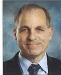
Louis J. Freeh

ABI is pleased to announce that Louis J. Freeh will deliver the keynote during the annual ABI luncheon at the 89th Annual Meeting of the National Conference of Bankruptcy Judges on Sept. 29 in Miami. He is currently a partner and immediate past chair of the executive committee of Pepper Hamilton LLP. Mr. Freeh has spent nearly 40 years in public life and service, beginning his legal career after graduating from law school at NYU Law School. His FBI career began in 1975 as a special agent in New York and later Washington, before returning to New York as chief of the Organized Crime Unit for the U.S. Attorney's Office in Manhattan. In 1991, he was named a judge in the Southern District of New York by President George H.W. Bush, then was named FBI director in 1993 by President Bill Clinton. While he was running the FBI (until 2001), the FBI was involved in a number of high-profile cases.