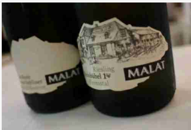
A new producer to me: Malat from the Kremstal. Amazing freshness and precision in the wines.