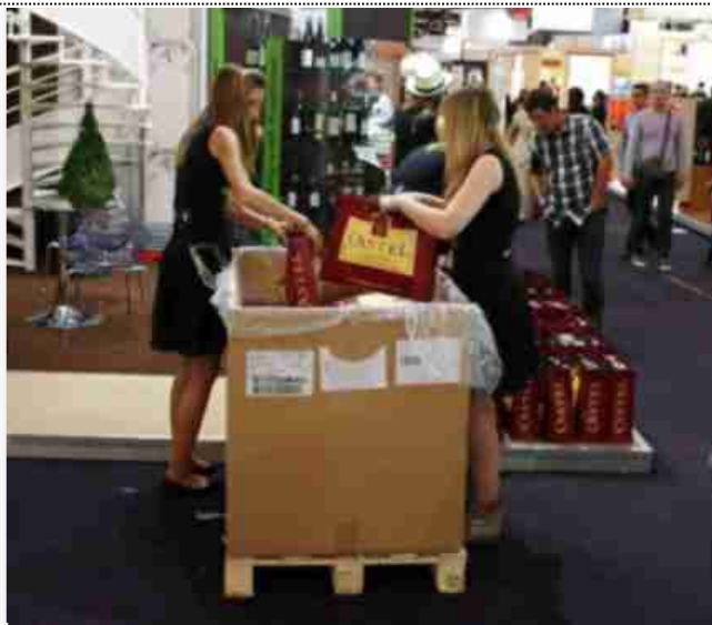
These Castel girls were unloading a pallet of gift bags every few hours, which – inexplicably – punters seemed keen to snaffle. But what was in them worth snaffling?

The scale of Vinexpo, with its multitiered stands and kilometre long exhibition hall, is quite daunting. It's not really a place for journalists to come to taste wine; it's more about doing business.