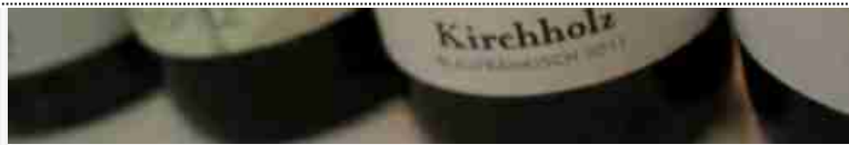
An impressive Blaufrankisch from Weningen. Just beautiful: rich yet quite elegant.