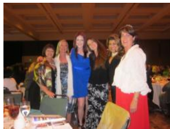
FTL/PB at the International TOBYs