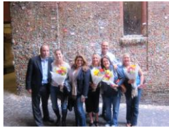
FTL/PB at the Pike Market Gum Wall, International Conference