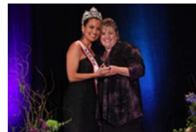
Orange Park woman receives national honor for her volunteer work fighting blindness.

The purpose of the Expo is to help building owners, engineers, and property managers learn to apply environmentally sustainable practices that reduce operational costs, increase efficiency, and enhance the value and aesthetic appeal of their properties. To learn more about this event, visit www.bomajacksonville.com .