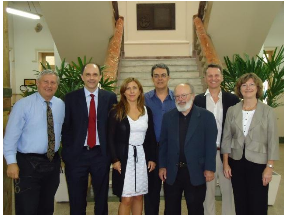
Faculty of the Brazilian Conference

and Brazil compared their national approaches to determining covered health care benefits and controlling the cost of care. All four countries are implementing health reform legislation. Held at the Law School of Fluminense Federal University, the conference attracted a number of Brazilian judges who are confronting difficult cases interpreting Brazil's new health law.