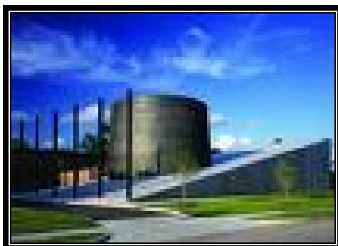
Houston Holocaust Museum

Houston Holocaust Museum, November 13, 2007.