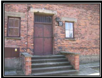
Block 10 at Auschwitz Concentration Camp Human medical experiments were performed in this barrack.