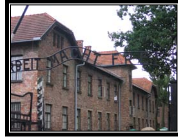
Arbeit Macht Frei ( Work Brings Freedom ) Sign over entrance to Auschwitz Concentration Camp.