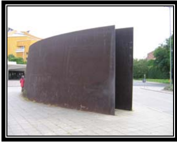
Tiergarten Strasse Vier (T-4) Memorial