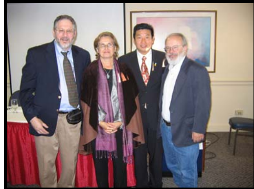
Interethnic Interfaith Leadership Conference