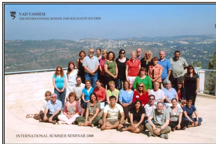
International Conference on Holocaust Education