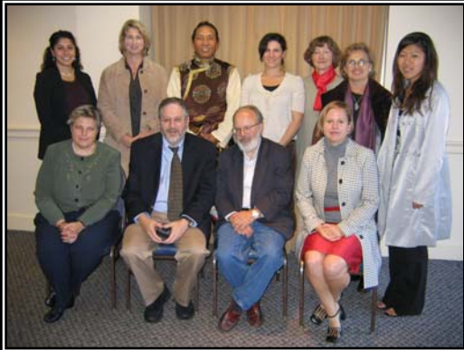
50 th Anniversary of Health Law at Boston University