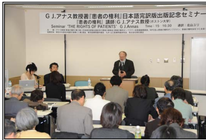
The Rights of Patients Seminar