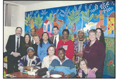
BCRHHR Staff and Refugees

The BCRHHR staff has published many articles this year, including one in JAMA, and has also made presentations at the annual meeting of both the Society of General Internal Medicine and the American Public Health Association, both in Washington, D.C. The BCRHHR has also conducted in-service training sessions for residents at Boston Medical Center, as well as training for other professionals in collaboration with Physicians for Human Rights, American Public Health Association and Francois Bagnoud Center for Health and Human Rights (FXB).