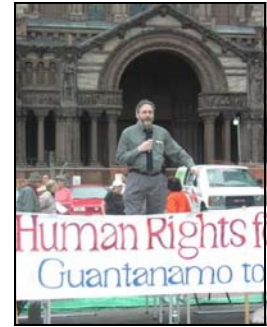
Dr. Michael Grodin during Democratic National Convention - Boston, July 2004

“Declaration on Universal Norms on Bioethics.” The following is an excerpt: “GLP urges you to recognize the Universal Declaration of Human Rights as the fundamental universal declaration of bioethics as well, and to see your charge as articulating how the universal principles of the declaration can be applied to bioethics and bio-ethical controversies. GLP believes it is more important to concentrate on new and creative ways to promote and enforce the UDHR, and to use it to develop more specific instruments like the Universal Declaration on the Human Genome and Human Rights, than to attempt to create what may be perceived as a competing set of univer- sal standards for medicine and bioethics”.