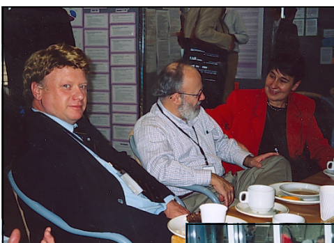
Participants in GLP Sponsored Roundtable on Strategies to Unite Bioethics & Human Rights - 7th World Congress in Sydney, Australia