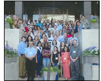
Health & Human Rights Class of 2004

GLP and the Boston Center for Refugee Health and Human Rights organized several trainings for physicians, psychologists and social workers on health and human rights for survivors of torture and refugee trauma.