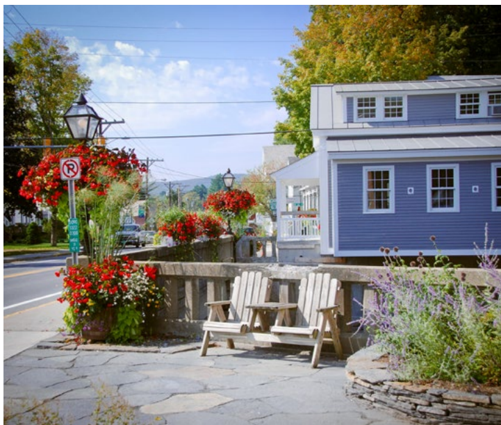
Wilmington - after the flood

The National Main Street Program featured V-DAT as its Story of the Week . The article told the story of how eight Vermont communities turned massive flooding into opportunities to improve their physical design, hone their marketing messages, and build back stronger than before the flood. For more information, contact Richard Amore .