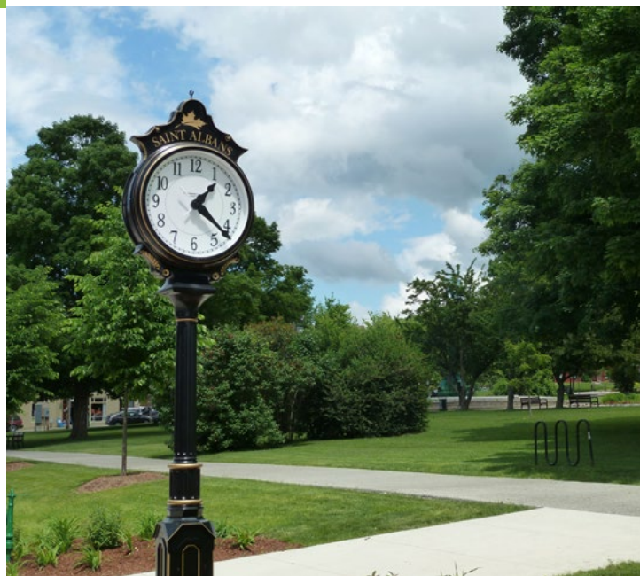
Taylor Park in St. Albans, VT

VTASLA Documents 3 Historical Landscapes