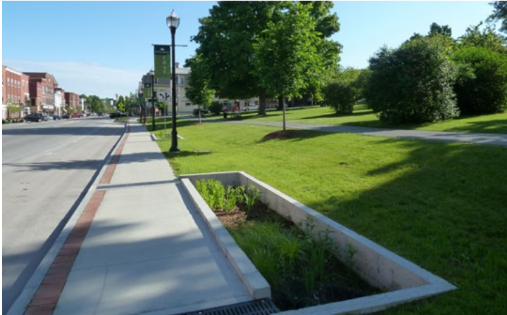
Green infrastructure in St. Albans

Parks are not only great places to enjoy, they help keep our water clean. A new report by the Trust for Public Land shines a light on the successes and challenges in using parks and green infrastructure to improve water quality and make our communities more desirable and livable.