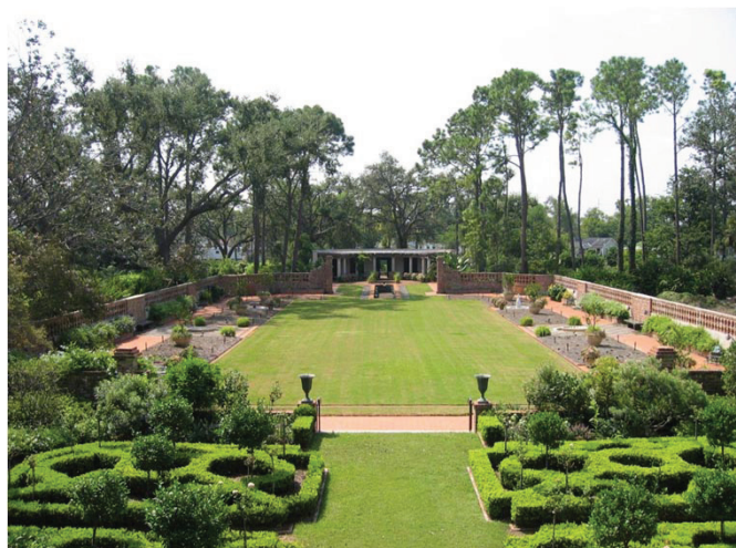
Award of Excellence: Longue Vue House & Gardens Landscape Renewal Plan for Katrina Recovery – Heritage Landscapes LLC, Preservation Landscape Architects and Planners