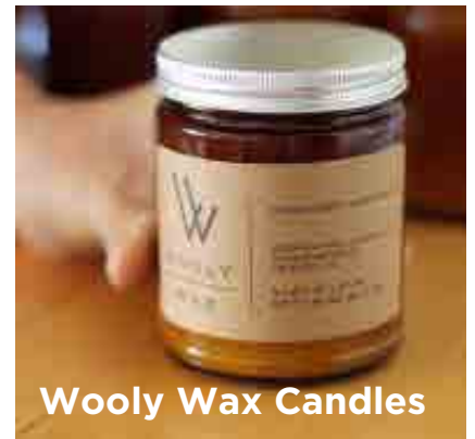
Woolly Wax Candles

Join Urban Luxe this First Friday, February 5th from 6pm - 9pm as we kick off the 2016 season with our largest and most elegantly curated Artisan Pop-up Shop. Six vendors and one artist will showcase their locally made, hand crafted goods in the chic setting of the Urban Luxe RiNo space. It is your opportunity to meet the makers and support your local small businesses, while enjoying an elevated shopping experience.