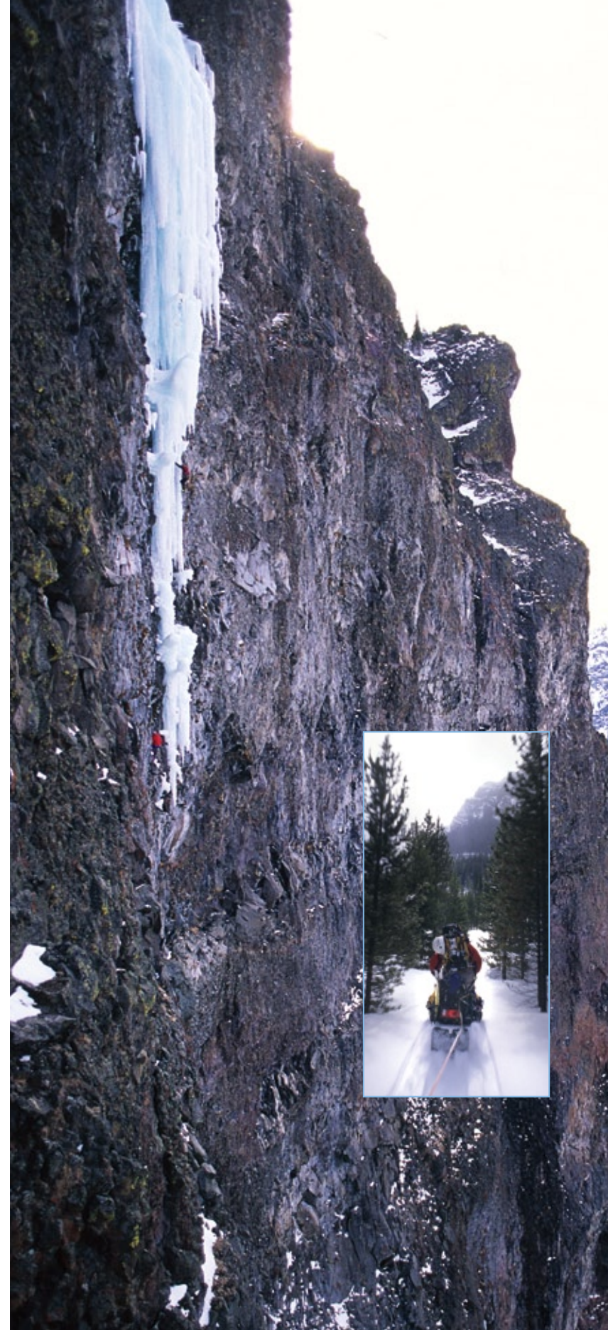
© (inset) When the road snows in your only option to ice climb is via the snow machine. (left) The late Alex Lowe and Vera Wong on the canyon's most spectacular Winter Dance. © KRISTOFFER ERICKSON

...DEDICATED LOCAL CLIMBERS POOLED THEIR RESOURCES AND PUT THEIR HEADS DOWN. THEY HAD TO WORK THIS OUT.