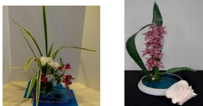
Examples from our 2014 Exhibition

Our next meeting is Monday, November 28th at the Sarasota Garden Club begins at 10:00 am. Following our business meeting, Pat Bonarek will present a brief demonstration followed by a workshop focusing on the use of "Water Space in Ikebana". Water is a vital part of nature which is needed to grow and maintain all of nature's bounty. If you would like to participate in the workshop, bring a moribana style vase (low flat vase) and fresh floral materials.