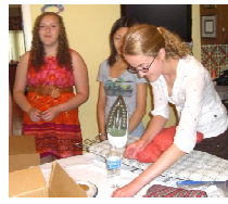
Teens putting on face features