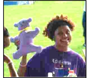
Cancer survivor with her special bear