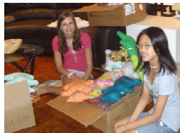
Teens boxing bears for delivery