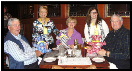
Bears volunteers thanking World War II vets