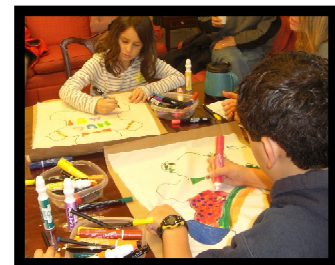
Children designing bears

On November 13, North Shore Community Bank sponsored our children's craft program as a community event. Kids came to the bank and designed a bear on unprinted fabric with special paint markers. We will be able to make seventeen bears from the designs the children created. When the bears are ready for delivery, they will be given to the Skokie Police Department . Police Officers give bears to children in trauma from a car accident; domestic disturbance; or criminal incident.