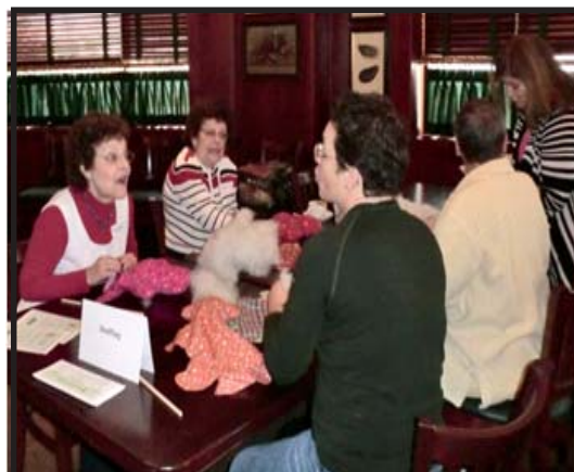
Volunteers stuff bears