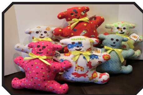
Bears waiting to be packed for delivery.