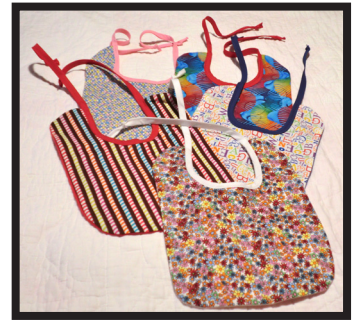
Baby bibs made from left over fabric