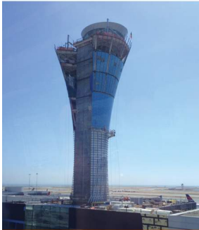
San Francisco Airport New ATCT $100M