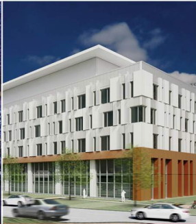
Veterans Affairs Replacement Medical Center $710M