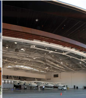
Virgin Galactic Spaceport America Terminal and Hangar $32.5M