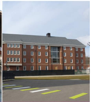
Ohio University Housing Development, Ph 1 $70M