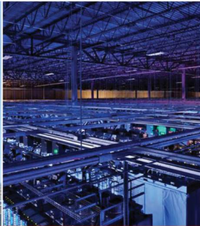
Confidential Data Center $250M Colocation Facility 32MW to 128 MW build 1.1 PUE