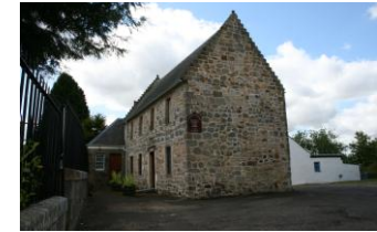
Douglas Heritage Museum