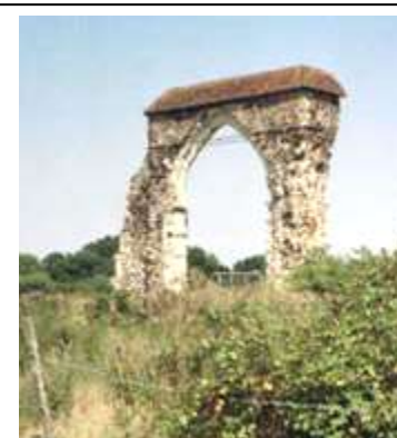
Bycknacre Priory, originally Woodham Priory (many spellings)

In 1296 when William le Hardi pledged fealty to Edward King of England at Berwick Castle in August, heralds were dispatched to over six counties in Scotland that the Douglas had been restored. To the casual reader, it could be assumed that Lord Douglas held lands from sea to sea in Scotland. But that was not the true situation. In 1289 he married a wealthy widow, Eleanora Lovaine de Ferrers. Her mother-in-law was the late Margaret de Quincy, Lady de Ferrers. After Margaret's father died without issue male, she and her two sisters, Helen de la Zouche and Elizabeth de Comyn engaged in a huge court case involving Roger de Quincy's vast holdings in Scotland and England, as heirs to his estates. The lawsuits were not settled for nearly fourteen years after his death. Roger de Quincy was not only the Second Earl of Winchester but also he was the Constable of Scotland, heir to one-third of the Lordship of Galloway as well as other vast lands and manors in Fife, the Lothians, and Ayrshire, just to name a few.