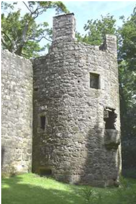
The Glassin Tower

Historic Environment Scotland believe this tower was added around 1550. It would have provided cosier living quarters than the old tower house, and Mary stayed here for the first part of her stay, before she was moved to the much more secure tower house to make escape less likely.