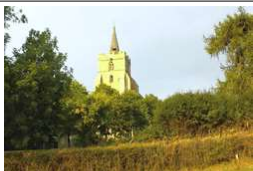
13 th c. Stebbing church...adjacent to the Ruins of the scarcely seen ancient priory