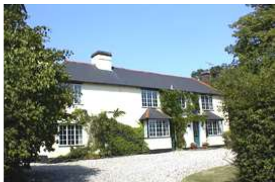
Rebuilt Woodham Hall, the original site of the Eleanora and William Douglas manor in 1291

estate that was given to Eleanora was designated as Stebbing Park and included the site of the original medieval manor house and moat. The Park was actually a major part of the extensive land holding described in charters as Stebbing. I have stayed in a local B&B in the village of that medieval manor several times as it provided me with a central Essex location from which to explore that and other nearby estates. There is still water that surrounds the manor house that is believed to be part of an original moat system for defense. The ancient church in the village also dates to the 1200's. Of note, about a mile from the Stebbing Park manor house are the medieval ruins of Little Dunmow Priory that includes part of the original church; according to her will, it is where Eleanora Douglas was buried in 1328.