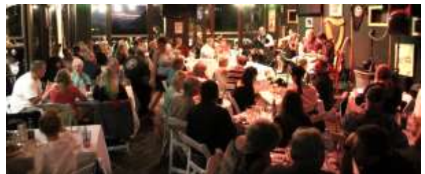
The many who gathered at Mulligan's On The Blue for an evening of Scottish tradition