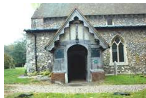
12 th c. Woodham Ferrers church with original medieval cherubs...in the village of the 1291 manor

There were two major de Quincy manors in England that were held in dower right by Eleanora, Lady Douglas and her husband William le Hardi, Lord Douglas, as of 1295. The dower portion of the entire