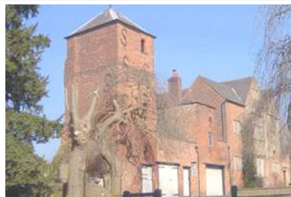
Groby Hall...Derbyshire...this is the new hall built next to the original manor held by the de Ferrers in the 1200's

In a subsequent article I hope to explore the Scottish estates with some insights on how they were acquired along with some photographs to help the reader visualize the vastness of these Douglas medieval holdings, well before the extensive lands acquisitions the family made through the grants from King Robert the Brus to his trusted Lieutenant, the Good Sir James. As one of Scotland's oldest families the Douglasses, through their support of the king, their strategic marriages and political alliances went on to acquire many lands throughout the country. To read about these early Douglasses I have included many stories on my website, www.mytruthliesintheruins.com .