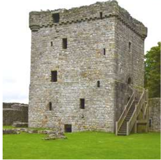
The tower house from inside the castle The ground floor entrance is a later addition. The tower was entered by the second floor door, accessible by a wooden stair which would have been removed in times of war. Tower houses were often accessed by wooden stairs to a first floor door for added security, rather than the second floor.

As time passed Mary started to recover, and the legendary Stuart charm returned to this still beautiful twenty-four year old woman. The owner of the castle, Mary's gaoler Sir William Douglas, had a younger brother George. They also had a young relation, Willie Douglas, living with them. Willie's parents had died and therefore he was in his Douglas relatives' care. Soon Mary had charmed George and Willie, and they were intent on helping her to escape.