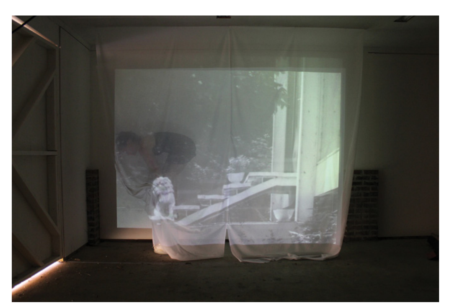
Nora Wendl, Glass House (Levitation), 2013. 24 x 36" C-print