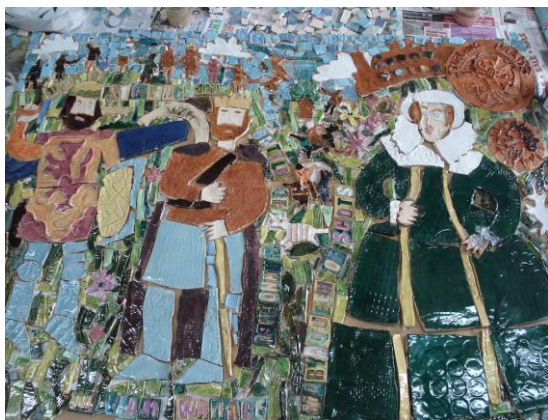
'Bannockburn Mosaic by Bannockburn Primary School