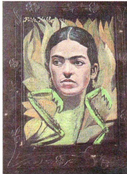
Mantis religiosa is part of the Noyola collection that will be the subject of two Dallas Art Fair symposiums.

● The “Finding Frida” symposiums will take place Saturday and Sunday from 10 a.m. to noon at the Montgomery Arts Theater at Booker T. Washington High School for the Performing and Visual Arts, 2501 Flora St. in the Dallas Arts District. “Finding Frida,” which features 20 items from the Noyola collection, is free with a ticket to the Art Fair (see pricing above).