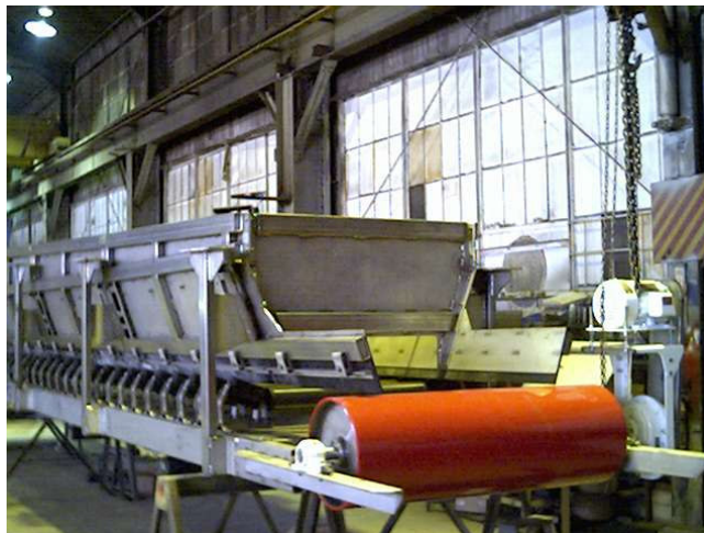
Stainless filter cake feeder belt with urethane pulley