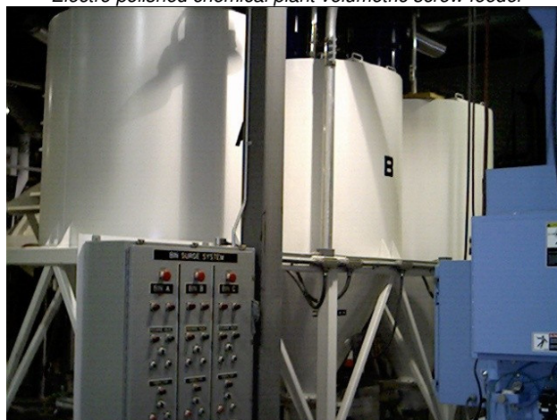
Modular bin storage system with controls for fill and discharge equipment