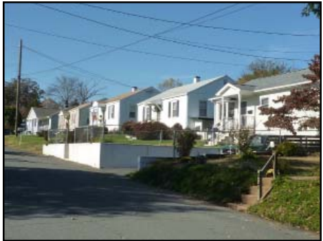
Housing for Ix Mill Workers

Highlights of the walking tour include a discussion of the history of the Frank Ix & Sons textile factory and the houses located throughout Belmont that the company built for its employees. The interior of one of these houses may be open for viewing.