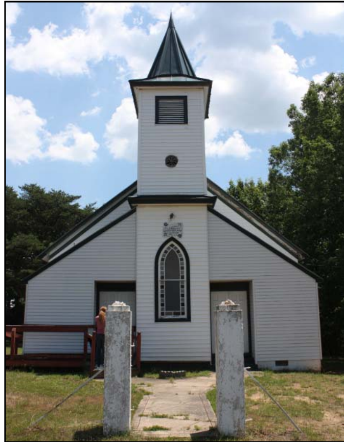
Pleasant Grove Baptist Church photographed during Preservation Piedmont's June 2012 documentation

Pleasant Grove Baptist Church, built in 1875, is a wood-frame church building, entered from two doors on the west elevation, which are separated by a pointed-arch window. The entry portico supports a steeple with a pointed cap, which rises above the gable-roofed nave of the church, lit by five six-over-six wooden windows on the north and south elevations. The fabric of the building is largely original and much of it is in good condition, including original beadboard beneath modern plaster on the walls of the nave. The original beadboard is exposed elsewhere throughout the interior.