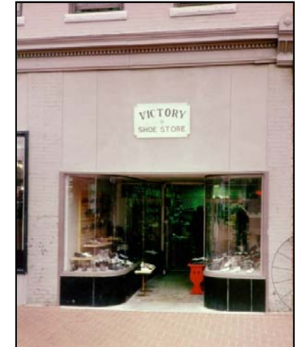
Original Victory Shoe Store façade at 219 West Main Street

demolition occurred illegally. The City filed a suit in Circuit Court seeking damages based upon the unauthorized demolition of a historic structure. Unfortunately, in such cases, what has been lost in demolition can never simply just be replaced because once the historic fabric is gone, it is gone forever. Gieck then submitted a plan to the BAR for approval to rebuild the façade to a 1920's design intended to look like the original building façade may have looked.