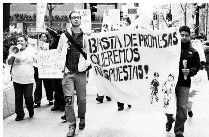
'Enough with promises, we want action!'

Of course we can't change the dynamics of sexist relationships overnight but in the context of the class struggle, as in the fight for la casita, men can learn to accept leadership from the women and struggle side-by-side. In the process of fighting capitalism, we can smash the gender roles that it requires, men and women as competing commodities to be exploited, and instead create new roles as comrades-in-arms. This struggle at la casita and with the Whittier mothers is in its infancy. We will continue to fight and struggle. ✪