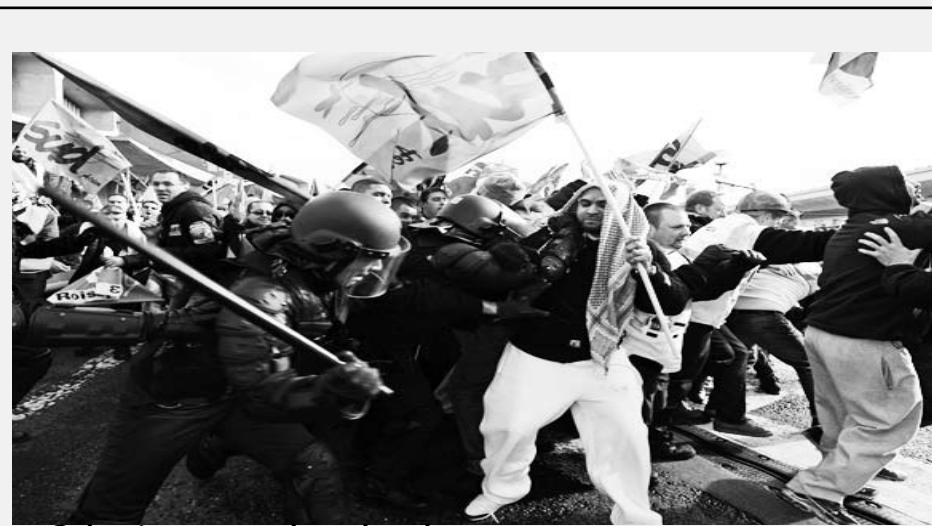
Orly airport workers battle cops.