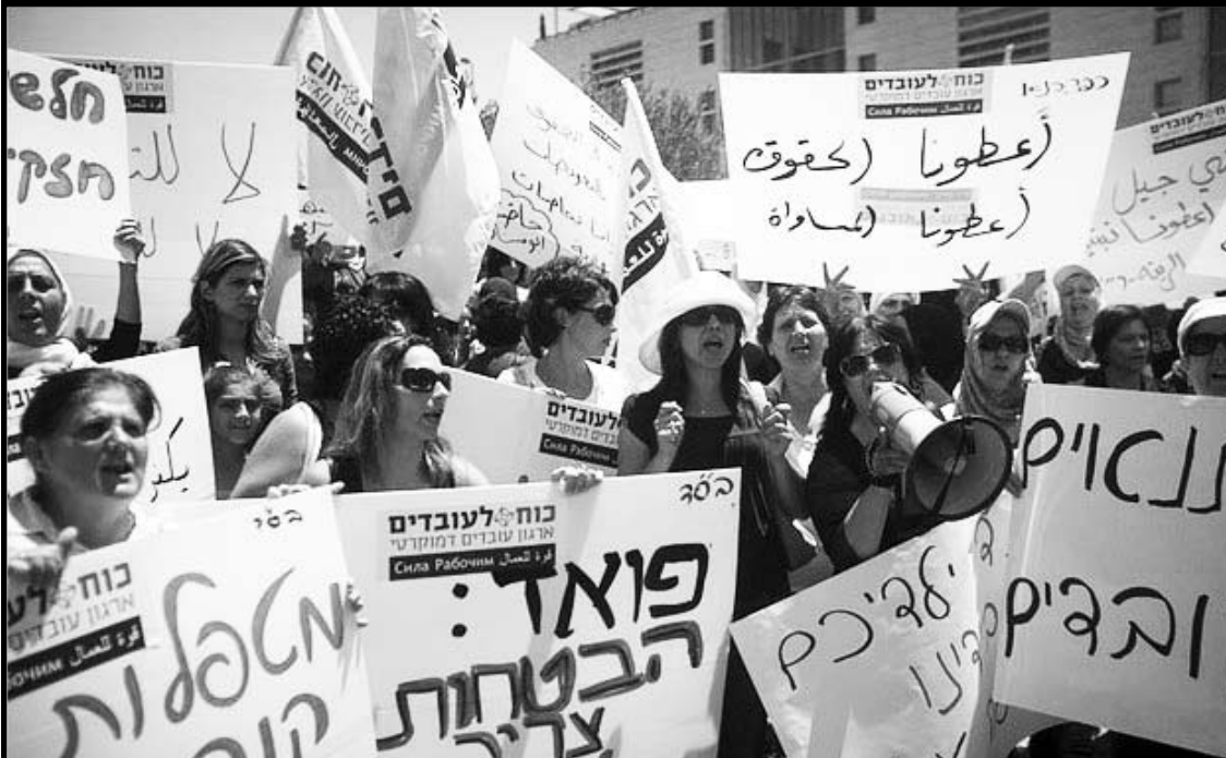
Day-care workers fight poverty conditions.

ISRAEL, November 2 — Arab and Jewish women day-care workers are showing multi-racial unity by battling against their extreme sexist exploitation. While some are fighting only for a wage increase, others are also demanding direct employment with full wages and benefits, as well as for an end to their demeaning working conditions.