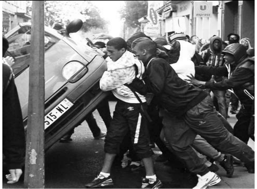
High School Students in France fight back!

Throughout this struggle both parents and students have been very supportive. They've told the principal, the head of security and the outside city investigators that what students do after school is their parents' concern, not the principal's. The