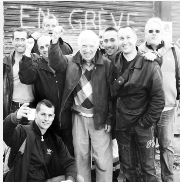
PL'er brings solidarity greetings from U.S. workers to Nantes sanitation strikers.

Assuming the enactment of this law, and the presumed scaling down of the struggle, it will have reflected the failure of even this massive movement to defeat the rulers' attack on workers' pensions.