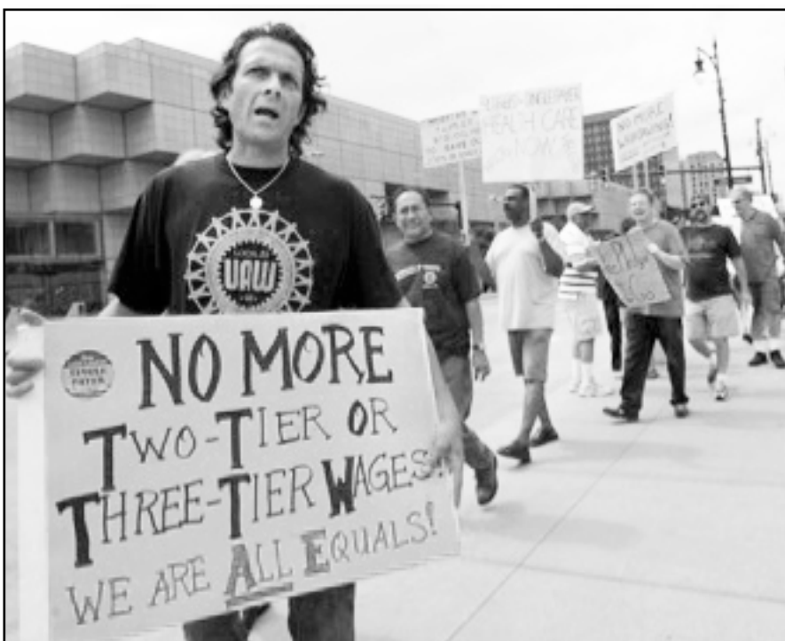
Angry auto workers blast union mis-leaders.

Since the Chrysler bailout of 1979, the UAW has given up billions in concessions and more than a million jobs, all in the name of “job security.” Today they represent less than half of the U.S. auto industry and have lost two-thirds of our members. Class collaboration does not save jobs. Our security lies with the international working class, sharper and sharper class struggle and the development of mass communist consciousness. Ultimately we have to overthrow the bosses and abolish wage slavery with communist revolution. ☸