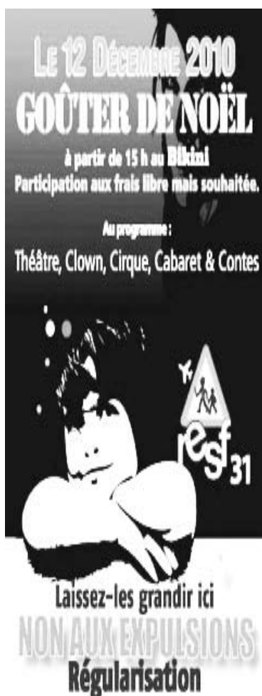
Poster for the holiday celebration for the children of undocumented workers.