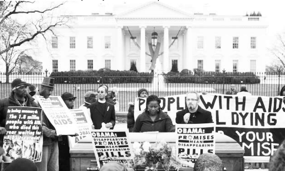
Demonstrators expose Obama's "promises."

MWPFA members attended a conference of several hundred people at Howard University on "Stigma." Blaming the victim divides the working class, families and isolates people with HIV. This is also racist, as homelessness and illnesses are greater among black and Latino populations. The existence of capitalism hinges upon reproducing these inequalities. Only working-class unity and militancy can combat the problems of racism and poverty that drive the epidemic. ☺