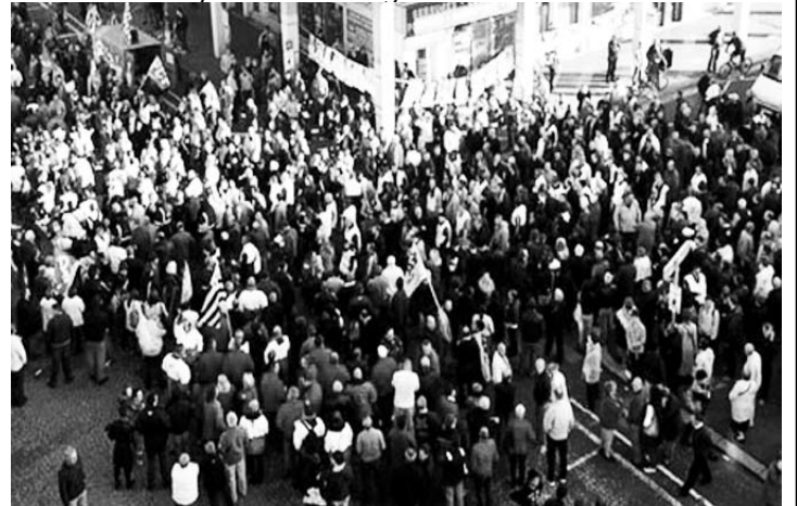
October 12, 2010 demonstration against retirement reform in Le Havre.

Our power to shut down production — and consequently profits — is one of our class's key weapons. But even this is only a small part of the struggle for communist revolution, the only road to definite victory for the working class. ☛