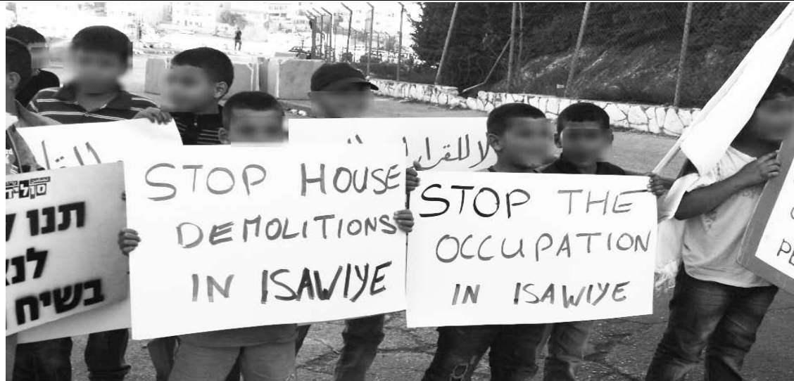
Jewish and Palestinian youth defy racist cops.

The residents of Issawiye, like the residents of