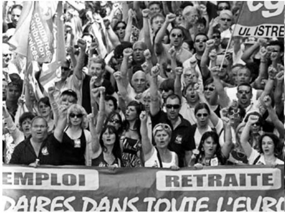
Demonstration in Marseilles. The banner reads "Jobs, Retirement, Solidarity Throughout Europe."