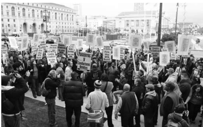
MUNI workers and riders, unite, march and rally.