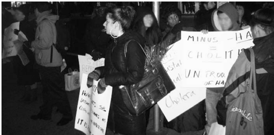
NYC workers and youth show solidarity with rebels in Haiti.

the way ahead for workers everywhere, as similar rebellions break out in Europe. As a black building worker we spoke to recently about racism against Latino immigrants told us: “The whole world is waiting for a revolutionary change!” The rally was coordinated with activist union and student friends in Haiti. They included a photo and a statement from our rally in their press conference at a demonstration against the military occupation by MINUSTAH (UN Mission to Stabilize Haiti) and for free public schools for all.