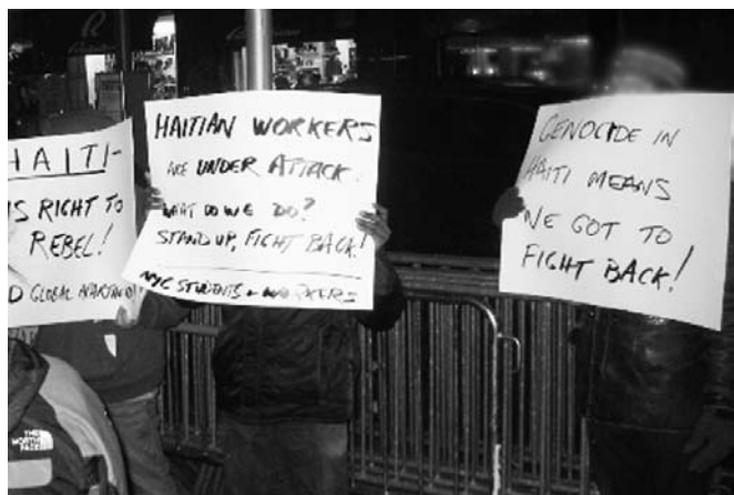
Protest genocide in Haiti

These small beginnings joining workers' forces in Haiti and the U.S. hold out hope that the international solidarity which the old communist movement once built can be rebuilt, on an even stronger political foundation. The only hope in places like Haiti is the revival of communism led by PLP. The same is true in the imperialist heartland, the U.S. Rebellious workers of all countries need one another to fight a global system. "The workers, united, will never be defeated!" "¡Oberos, unidos, jamás serán vencidos!" "Les ouvriers, unis, ne seront jamais conquis!" ☺