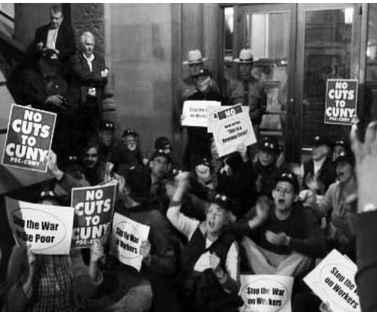
Protestors defy KKKops in order to move.

occurred in the private sector (i.e., lower wages of GM workers), and now the plan is to impose it on public workers, who are far more unionized.