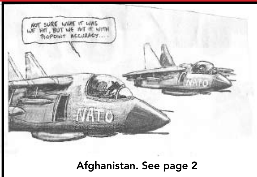
Afghanistan. See page 2

The same army and police that have brutalized workers in Haiti are now demolishing the shantytown favelas of Rio de Janeiro, leaving tens of thousands of residents without homes,...to make way for the World Cup and Olympic stadium mega-projects, which produce huge profits for the local ruling class and international bankers.