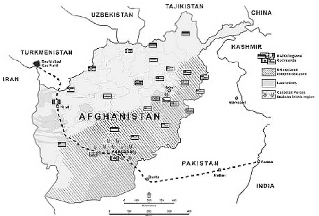
Dotted Line is TAPI

Obama & Co. ordered the Helmand strike in