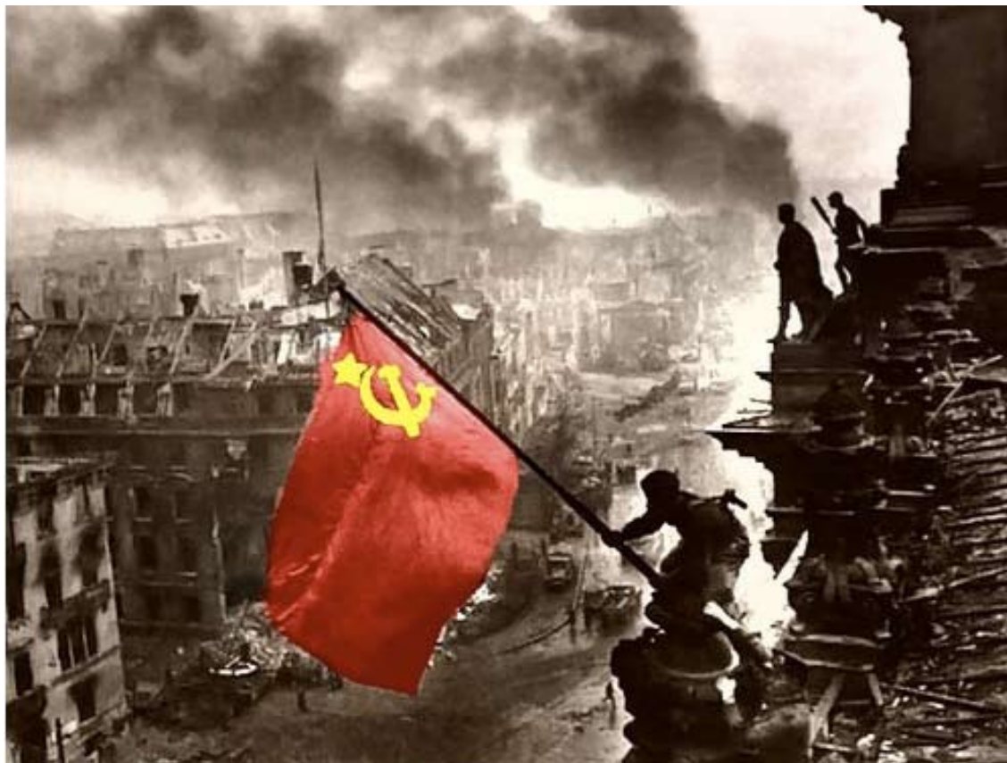
Red Army raises Soviet flag over Hitler's Berlin.

For more information on the role played by the Red Army and the communist movement in defeating the Nazis see the CHALLENGE supplement: "50 Years Ago: Communist Red Army Defeated the Nazis, May 17, 1995" in the PL website: plp.org.