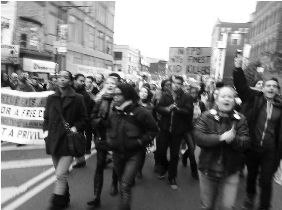
Students and Workers chant "NYPD KKK, How Many Kids Did You Kill Today?"