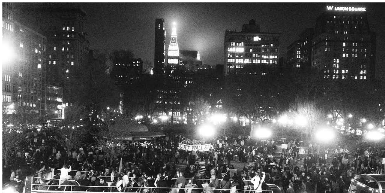
Occupy in Union Square: protest racist murders

At one point the City Councilmen's staffers pleaded with PLP members using the bullhorn to take the crowd