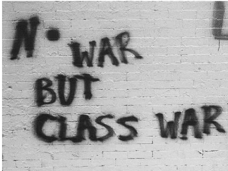
This was spraypainted by OWS outside of a High School

In the current period, the bosses' economic crisis and the trillions sunk into Afghanistan and Iraq have led to a wave of racist budget cuts and layoffs in public schools throughout the U.S. The results have been devastating. In New York City — the graduation rate hovers around 60 percent — and most graduates require remedial work before they can take college-level courses. In Philadelphia, where the schools had floundered under state stewardship for nearly a decade, district officials estimated it would take until the year 2123 to get all students up to