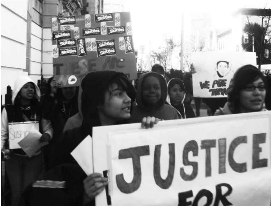
John Jay Students picketing against racist murder

BROOKLYN, NY, April 6 — “Who are we? Trayvon!” was chanted repeatedly by students and teachers picketing the John Jay campus here protesting the racist murder of black teenager Trayvon Martin. This was among the many actions angry high school students and teachers organized as news of his death reached the campus. As many of the black and Latino students have been targets of previous racist attacks, we were able to sympathize with Trayvon’s parents. No one could defend killer Zimmerman as it became clear that racism was a major cause of this murder.