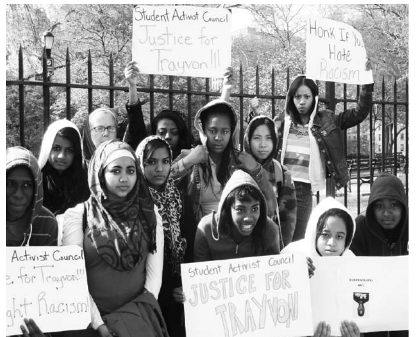
Students at Brooklyn’s Clara Barton H.S. demonstrate their hatred for racism.