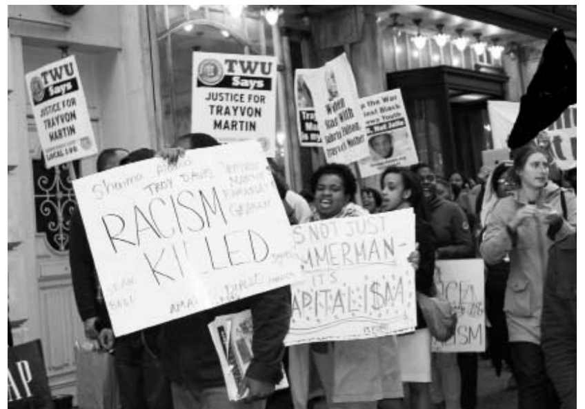
NEW YORK CITY — PL’ers join hundreds of anti-racists in a militant demonstration against police genocide of black youth.