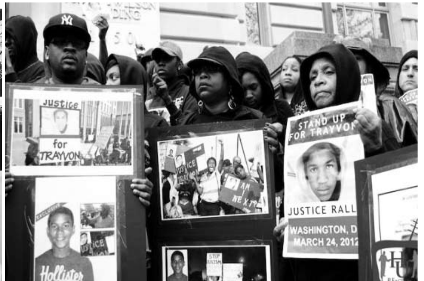
WASHINGTON, DC — “Tear down the whole damn system!” chanted Howard University Students (see page 4).

But this will not stop here. We’re continuing to encourage our classmates to come to rallies and protest the racism in all the class struggles facing us every day. Attending the May Day march on April 28 is a great way to continue this fight.✪