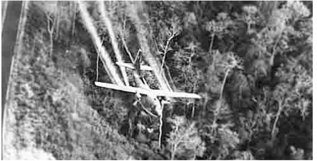
Agent Orange Genocide Hits 3 Million 40 Years Later. (See page 6)

The trillion-dollar funding for war requires savage cuts in wages, pensions, healthcare, schools and other social services. As a result, Obama's ruling-class publicists must lie to workers about his intent to end wars, while reassuring U.S. capitalists of his resolve to expand them.