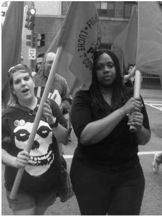
WASHINGTON, DC, May 1 — "1, 2, 3, 4, We declare class war, 5, 6, 7, 8, Smash the system, smash the state!"

Three hundred Occupiers and friends marched to the White House with red flags flying high to condemn the racist, capitalist system and politicians like Obama and Bush who foster imperialist war and the exploitation of the working class. Workers alongside the march saluted the May Day marchers with clenched fists of support and applause.