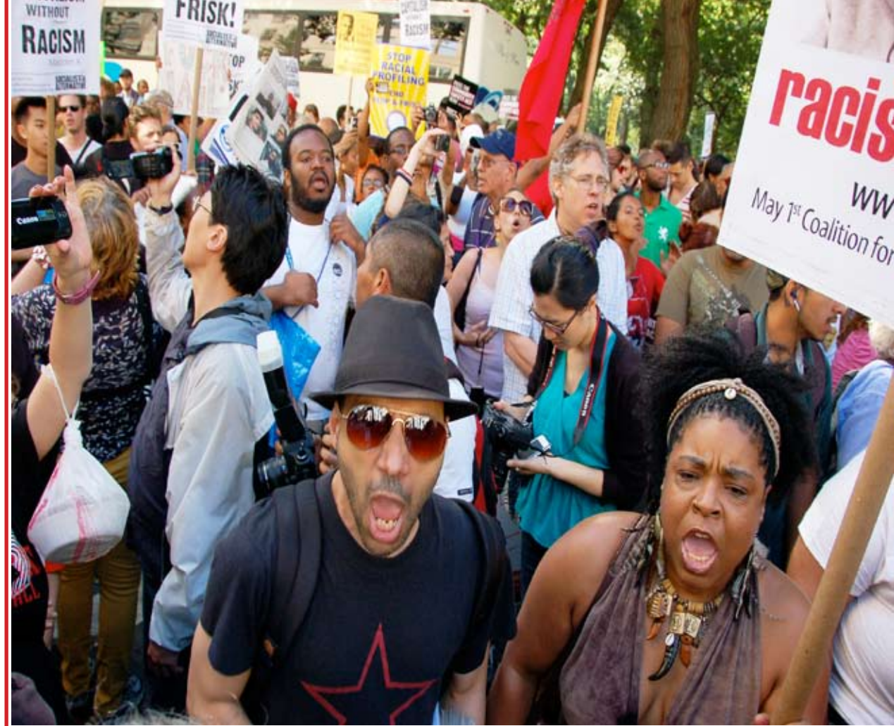
PL'ers and friends transform a passive rally into militant demonstration. See page 3

In addition to creating a slave-labor force of "guest workers," CIR includes the Dream Act, a bipartisan proposal to offer two routes to legalization: full-time college attendance leading to graduation (with no