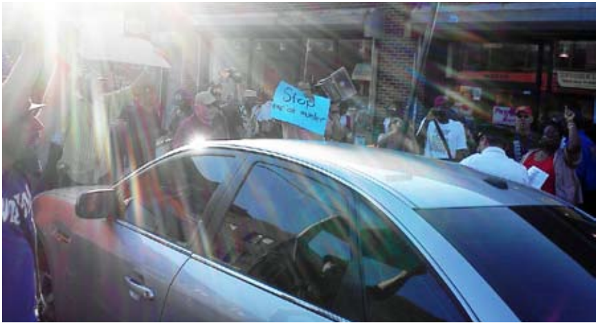
Protesters surround cop car, shouting "Murderers!"

Led by PL'ers and new friends, we marched to the precinct, more than a 100 strong. Workers joined us along the way. The protesters were angry and determined. People spoke of their experiences both with killer Atkins and with many other cops. CHALLENGES were used and