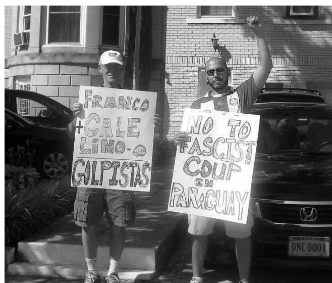
PL'ers rally in solidarity with workers and farmers of Paraguay.