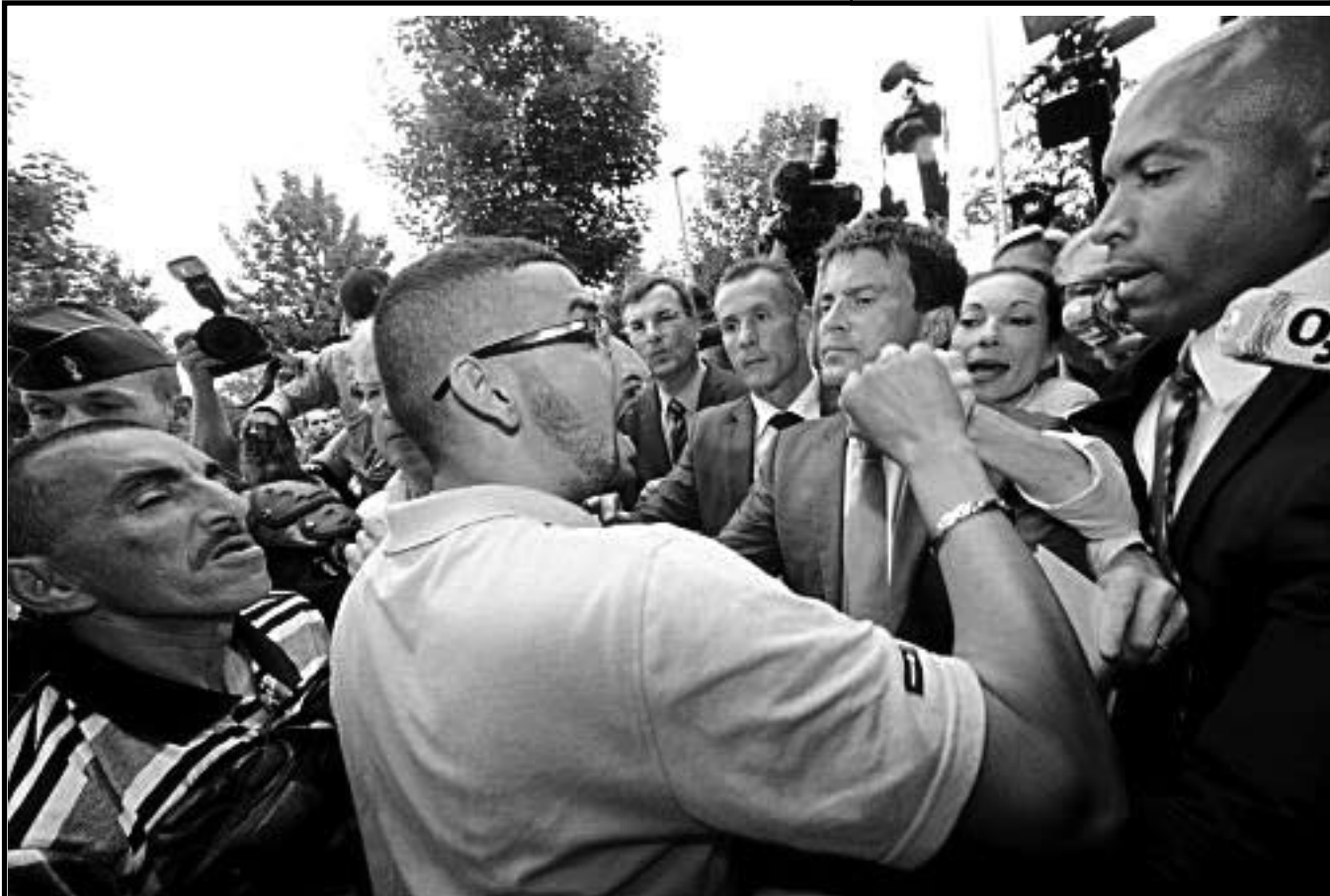
AMIENS, FRANCE, August 12 — Workers in this small town rebelled against lack of jobs and cuts stemming from the continuing euro economic crisis. Pictured are residents attacking the French interior Minister as he came to the town to quell workers' anger. Jobless youth clashed with cops, injuring 17, and burnt buildings in protest.