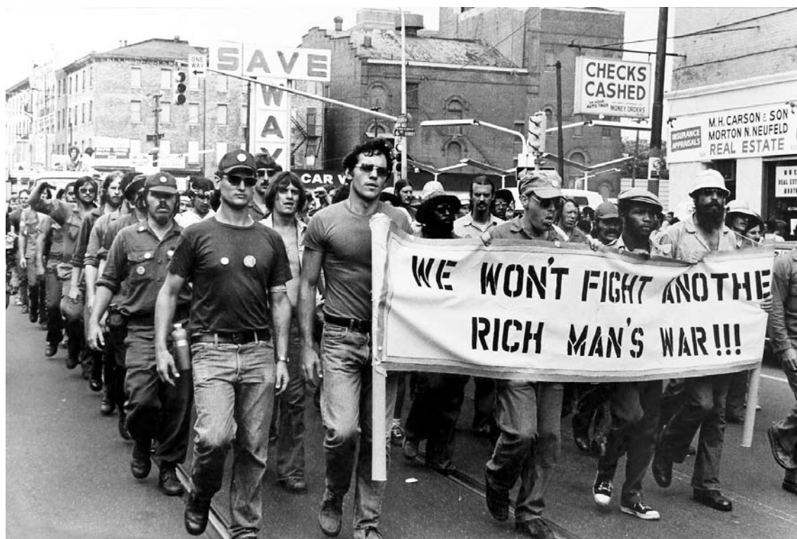
GI's march as part of mass movement and soldiers' and sailors' rebellion against the Vietnam War (see box, page 2).