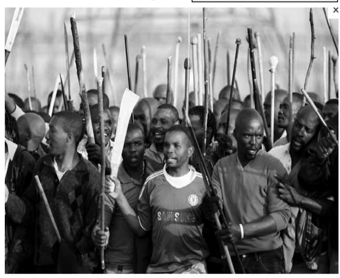
Miners in South Africa fight against bosses' attacks with arms (see page 2,8).

While bombing any of these might indeed re-