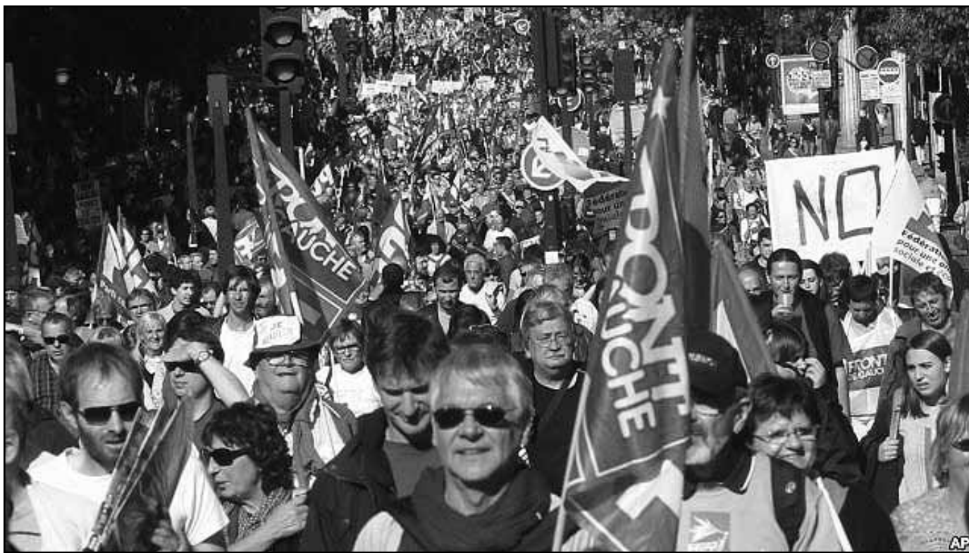
September 30 — Demonstration against austerity.

About 50 workers from the Fralib factory near Marseilles marched. “We are here above all to