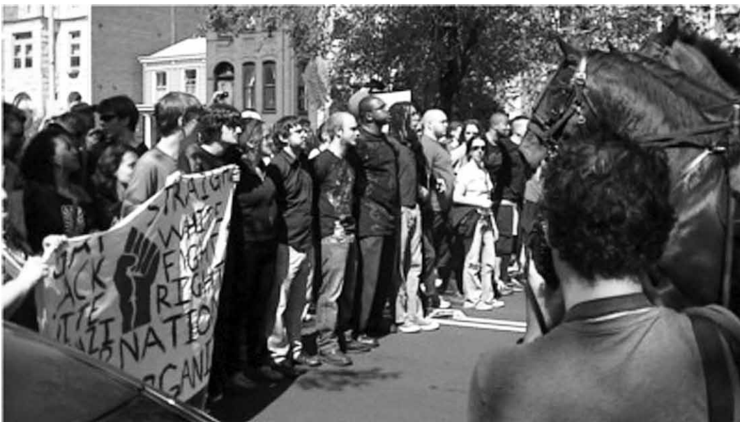
Youth form human blockade against neo-Nazis and cops.

WASHINGTON, DC, September 22 — Today, over 300 anti-racists confronted a dozen Nazi/Klan white supremacists. Only their 500-strong police escort saved them from severe beatings that would have discouraged them from future events. Protesters nevertheless drowned out their racist filth with militant anti-racist chants.