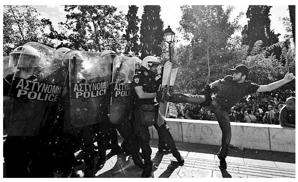
GREECE — As part of general strikes all over Europe, protester puts the boot on bosses' austerity.

I returned to Haiti last week and was in-