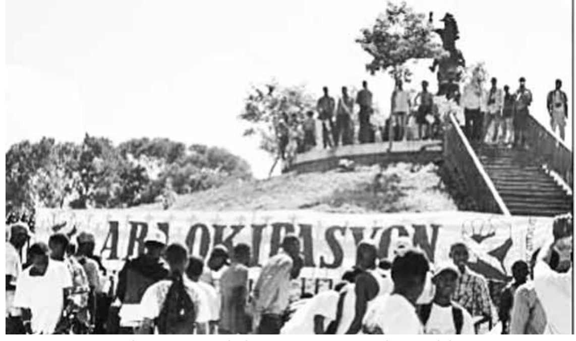
Students protest cholera in Haiti using a photo exhibit.

One comrade spoke about cholera awareness and then moved from a political analysis to mobilizing for the cholera campaign, linking problems of education to those of health. He noted that vaccination and ending cholera was right up there among the teachers' demands; that teachers be-