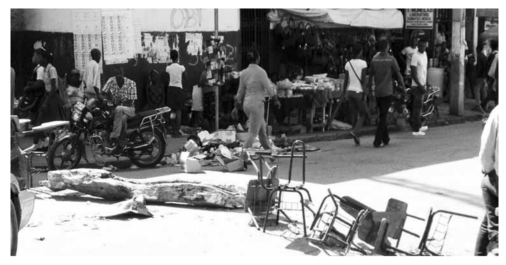
Students barricaded the downtown streets with tree trunks and chairs from their campuses.

ticipation in the teachers' strike the following day. Students spoke about revolution. A Party study group is in the works.