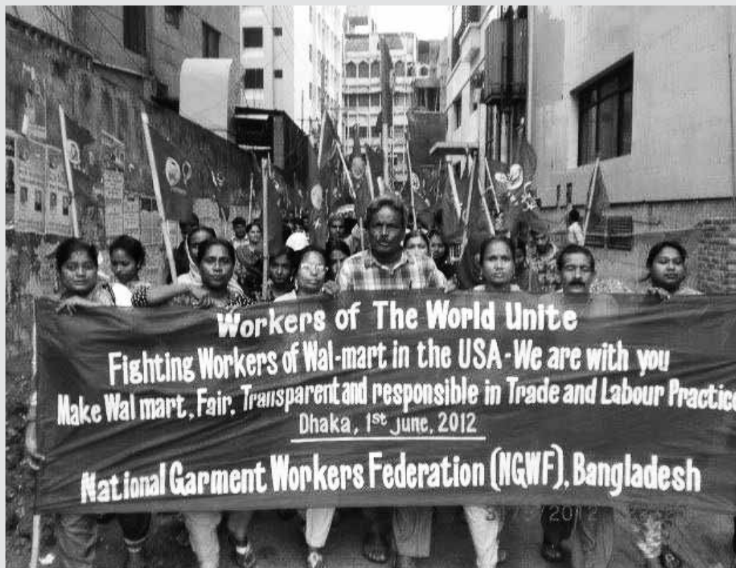
Garment Workers in Bangladesh Unite with Walmart Workers in the U.S.

DHAKA, BANGLADESH, November 27 — Thousands of garment workers poured into the streets of Ashulia, the industrial belt north of here, protesting the deaths of at least 112 mostly women workers, burnt alive in the Tarzeen Factory, trapped by poor escape routes.