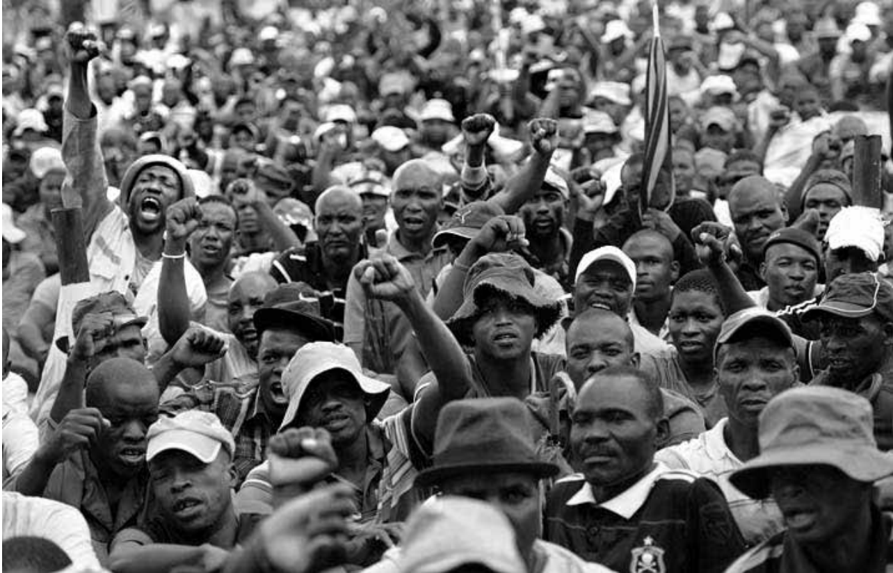
80,000 platinum miners on strike, crippling production and resisting the cops' rubber bullets and stun grenades.

There is life in the class struggle in South Africa. Leading the wave is a strategically important strike that is galvanizing workers and disrupting the global platinum market and the South African economy. On January 23, the world's big three platinum producers, Anglo American, Impala, and Lonmin, were struck by seventy thousand miners in the Association of Mineworkers & Construction Union (AMCU). This new and militant union is up against the African National Congress government, whose police fired rubber bullets into three thousand strikers trying to stop scabs at Anglo American.