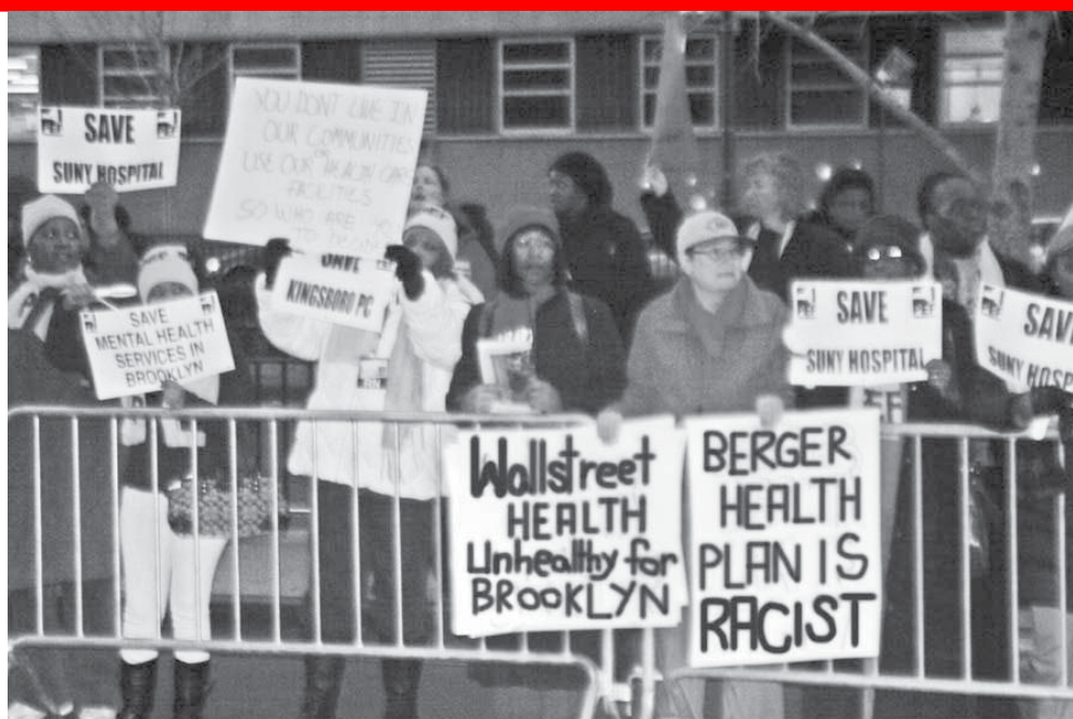
Rally of hospital workers in winter of 2012.