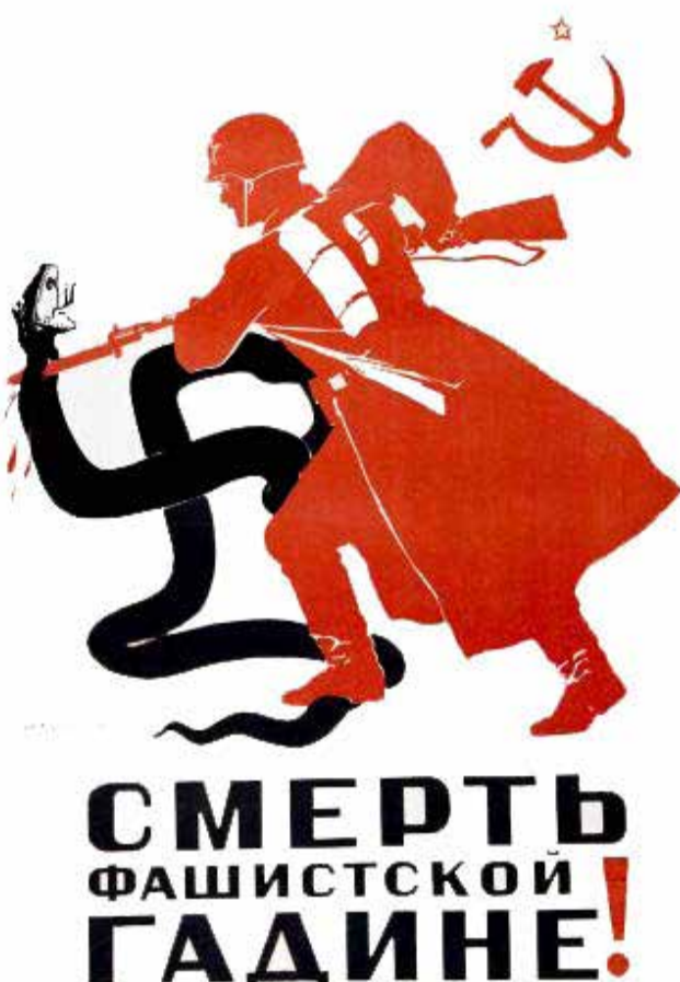
A Soviet Union poster during World War II. Communist have defeated Nazis in the past, and we will defeat them again. The caption reads, "Death to the Fascist Beast!" Build an international workers movement for communism with Progressive Labor Party.

Svoboda and Pravy Sektor attract the most racist and reactionary elements of Ukrainian society. They are being given free rein by the other opposition parties, and this fascist-tainted alliance is unreservedly backed by the EU and U.S. imperialists.