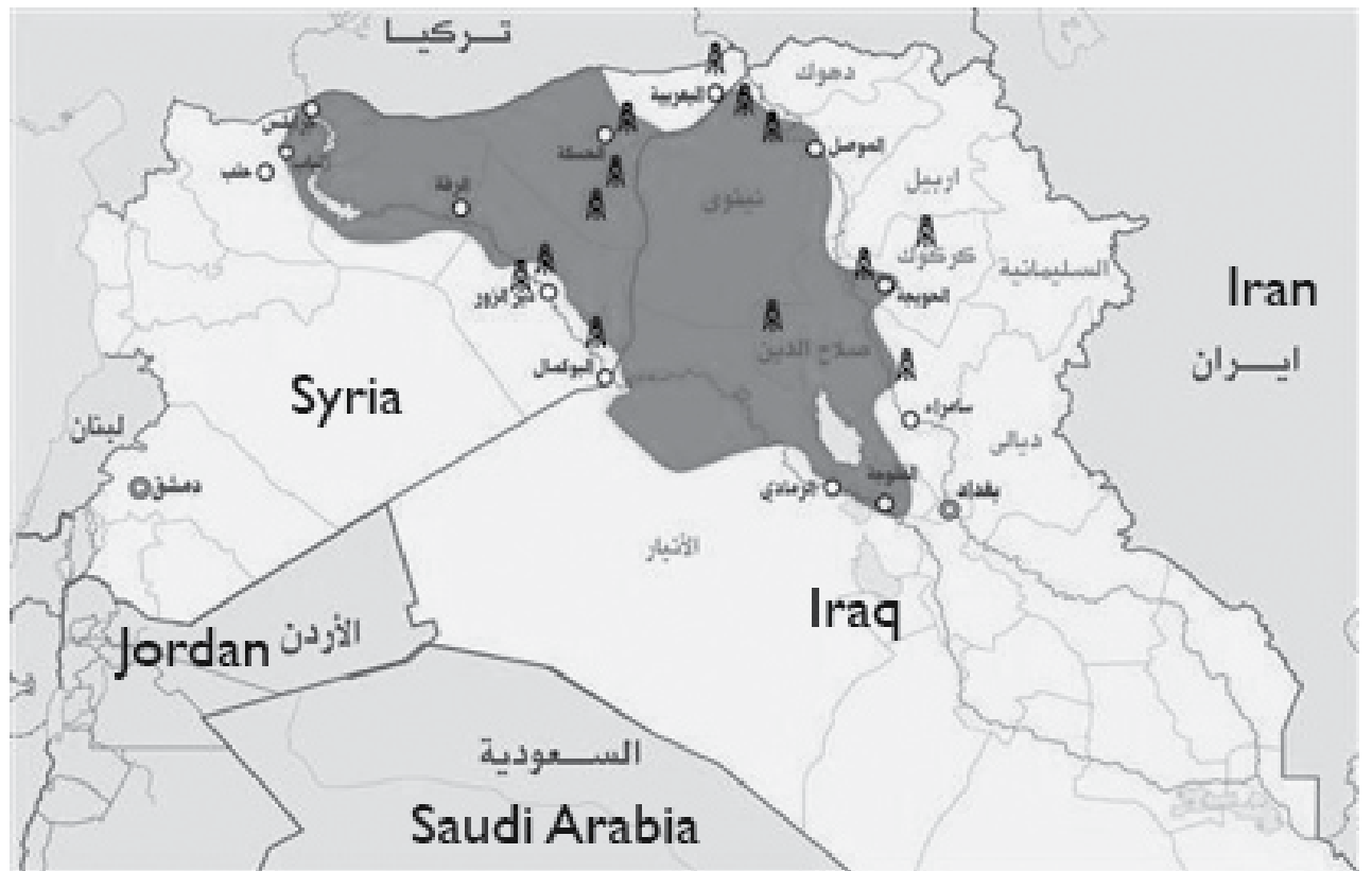
2006 ISIS map of its projected realm

Untold others will be slaughtered in the next shoot-out over oil. Meanwhile, U.S. rulers will use the ISIS threat to their interests to divide workers with anti-Muslim racism. Only communist-led revolution, smashing all bosses and profits, can end these horrors. Only the workers' seizure of state power can eliminate mass poverty, unemployment, racism, sexism and war. In