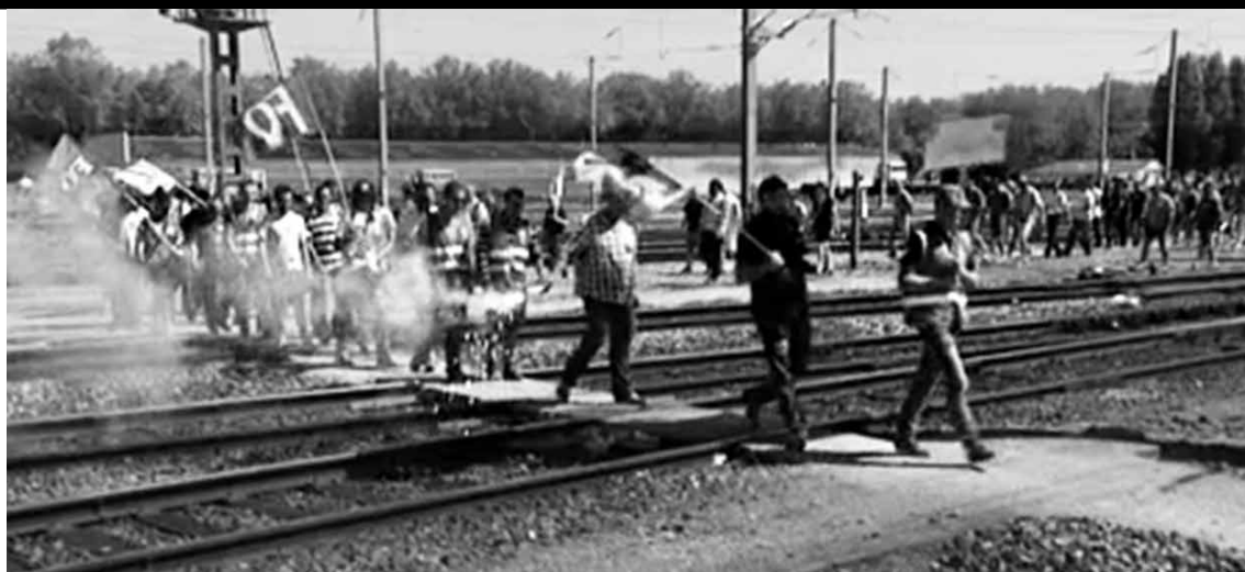
CAEN, FRANCE, June 13 — Striking rail workers blocking the tracks.

A TV report recounting the “comfort” of train drivers disgusted him. “Come and see... It seems we have bucket seats and a micro-wave oven! But we don’t even