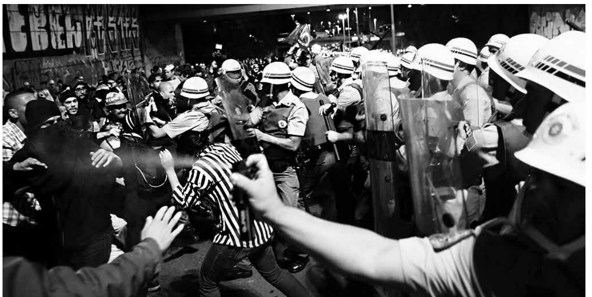
São Paulo, April 29 — About 1,500 marched in a World Cup demonstration. Many clashed with military cops spraying tear gas.

We are clear that no fight for reforms can solve the disaster of capitalism. Under communism, we will have our own games, but they will be comrades, for health and workers' enjoyment — not for profit. This is one more reason we have to fight the exploitation by the bosses. We must organize Progressive Labor Party to destroy capitalism and create a society run for and by the working class. Only communism will liberate us from the prison of profits and money. Join us!✪