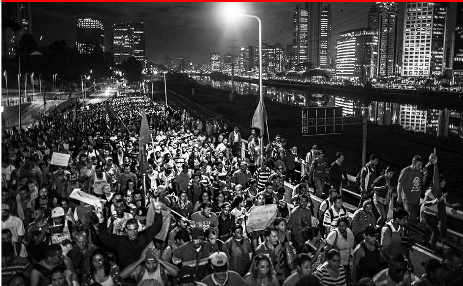
Homeless workers' movement marches in São Paulo

Protests against the World Cup won't stop. Teachers, doctors, transit and airline unions have struck. Neighborhood organizations are on the march. The state's response is typical: brutal repression by the police and military against the demonstrations. The Brazilian bosses have done everything to satisfy FIFA (International Federation of Associated Football), including a $9 billion investment to remodel and construct the stadiums. Meanwhile, the masses of workers are poverty-stricken. One of four is illiterate. Health care is awful and living conditions for most is abominable. The average monthly income is $250.