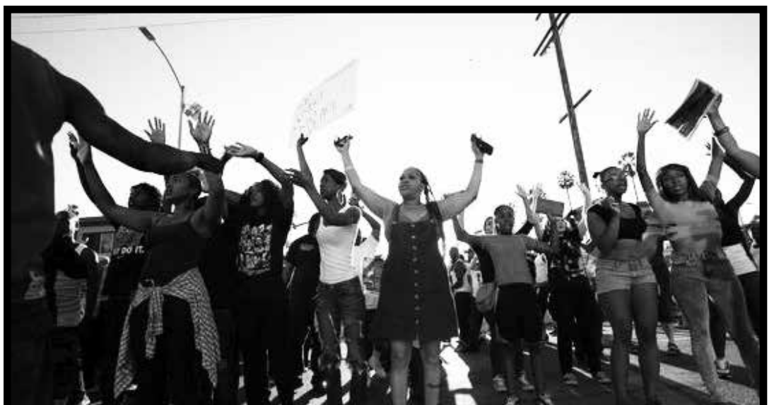
Los Angeles — Protest against cop killings

The list of names of those murdered by the racist police is already much too long. A system that survives based on racism and racist terror needs to be overthrown by communist revolution! ☪