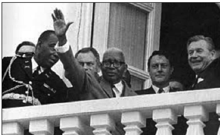
Francois Duvalier (center) with “liberal” Republican Nelson Rockefeller, Haiti 1969

making communist parties illegal, and in the 1950’s, government repression of communists, socialists, and independent trade unionists increased.