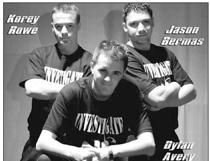
The creators of Loose Change

At another point in the film Loose Change claims that fires caused by jet fuel could not have reached the 3,000