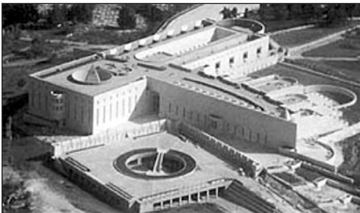
Masonic Design: Israeli Supreme Court or NWO HQ?

Jones' deception is nothing new however; he is simply rehashing the same lies that have been pushed throughout the last century in order to mobilize the population when capitalism is in crisis in a particular country. On his website he lists two chronologies that map out how this secret cabal has been manipulating governments and populations for the ultimate purpose of creating this New World Order. 32 Looking at these chronologies the astute reader quickly realizes that they have heard this story before. The "globalist conspiracy" is simply a rehashing of the Protocols of the Elders of Zion, the racist tract created by the Czar's secret police in order to tighten the screws on the Russian police state and attack the Left just before the Russian Revolution.