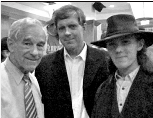
Ron Paul posing with Stormfront founder Don Black

During the 2012 election cycle Paul's barely submerged racism began to bubble up to the surface as copies of his old newsletter the Ron Paul Political Report resurfaced. In it Paul discusses paranoid racist fantasies about the "end of white America" and the "coming race war." Among his many racist statements regarding black people, in 1992 after the LA riots Paul wrote, "Order was only restored in L.A. when it came time for the blacks to pick up their welfare checks three days after rioting began... What if the checks had never arrived? No doubt the blacks would have fully privatized the welfare state through continued looting. But they were paid off and the violence subsided." Among his many anti-Semitic remarks, in 1993 he wrote, "Sneaky goddamn Jews are all alike." In 1994 as the world celebrated the end of Apartheid in South Africa Paul lamented the loss of the racist regime stating, "There goes South Africa" and warned of a "South African Holocaust." (The New Republic, 12/23/11; 1/17/12)