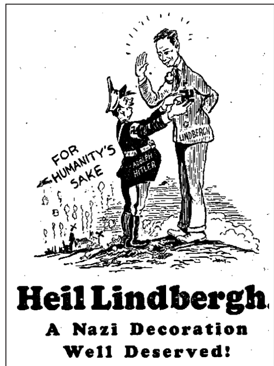
Cartoon criticizing Charles Lindbergh's acceptance of the Nazi Cross of the German Eagle medal in 1936. Like Henry Ford, Lindbergh refused to return the medal during the war.

The Zeitgeist film series is an attempt to analyze the world without getting into sticky issues like class-conflict or exploitation. Where the Marxist analysis of political economy is rejected by Zeitgeist it begins to erect a new view of the world. This view, infused with the paranoid individualism of modern capitalism, is one of super patriots fighting a cabal of international bankers to take back their country. Students of history will recognize this simply as the latest rehash of the racist Protocols myth (more on this later). The Protocols myth which placed all conflict in the world at the feet of “communist Jews” and their supposed “international banking conspiracy” formed the foundation for German fascism in the 1930’s. It is not surprising then that Zeitgeist opens its section on the