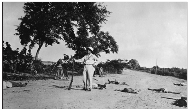
US officer surrounded by dead Haitians killed during the 1915 occupation

The racism of US Marines and the brutality of forced labor led to increasing armed struggle. 22 Haitian peasants, in some cases whole villages, began to join the armed caco resistance. 23 The more Haitians resisted, the more the corvée was imposed to build roads now needed to speed the movement of troops. Ultimately the Marines mounted a campaign of extermination. A curfew was declared, and any dark-skinned Haitian out after curfew could be shot on sight as a suspected guerilla. Entire villages were