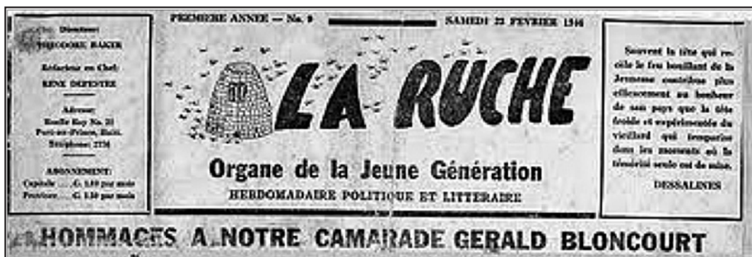
Masthead of student newspaper La Ruche , whose banning sparked the protests of 1946

In September, Aristide is deposed by a military coup led by former members of the Tonton Macoutes and by groups such as FRAPH allied with the traditional elite and funded and trained by the US (through the National Endowment for Democracy and other CIA funded groups).