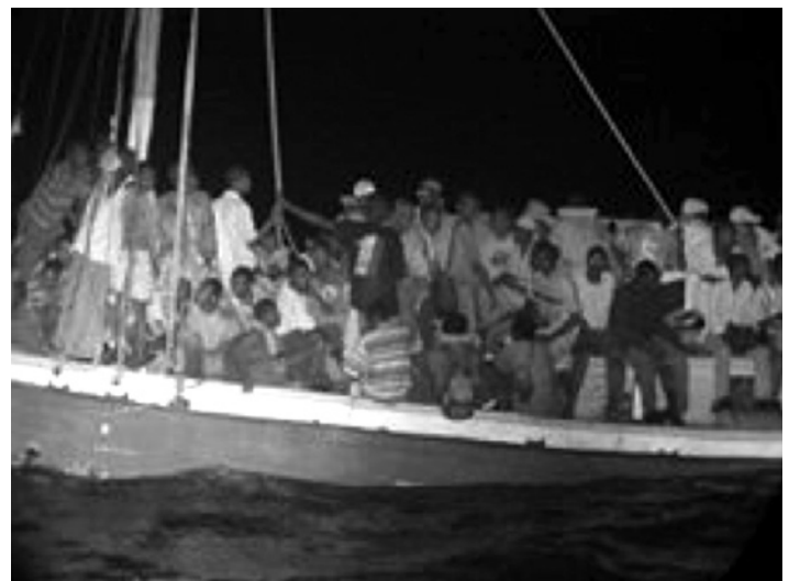
Haitian boat people

But, Aristide continued to carry out his promises to set up Free Trade Zones. In 2002, Aristide and the president of the Dominican Republic presided over the opening of the second free trade zone in the northeast on the border with the Dominican Republic. Coevi FTZ in Ouanaminthe was built on land taken from farmers by eminent domain. Its zone was part of the "Hispaniola Plan" to open some 14 free trade zones in Haiti, all to be subsidized by the US or the World Bank. By 2003, two more zones were in the works. The firms in Coevi FTZ were almost all Dominican-owned subcontractors for American companies, making clothing for