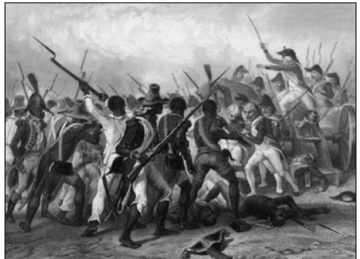
Haitian Revolution, Battle of Vertières, 1803

The Spanish in Santo Domingo, the eastern half of Hispaniola (now the Dominican Republic) recruited Toussaint Louverture, Dessalines, and other leaders of the slave insurgency to their army with offers of