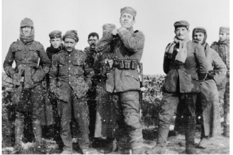
German soldiers of the 134th Saxon Regiment and British soldiers of the Royal Warwickshire Regiment meet in no man's land, December 26, 1914

...The soldiers began talking....One began to think that these chaps, who were like ourselves, whom we liked, and who felt about the war as we