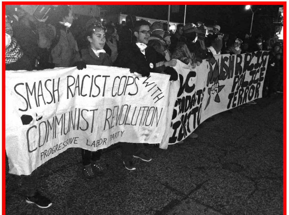
2014: Antiracist demonstration in Ferguson. Continue the fight in 2015 with PLP!