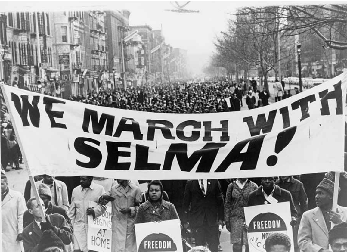
Workers in Harlem march in solidarity with Selma

The second march on the bridge showed clearly King’s inability to confront U.S. ruling class and state. The troops were ordered to pull back. But King’s “instinct,” as James Reed, a Unitarian minister put it, told