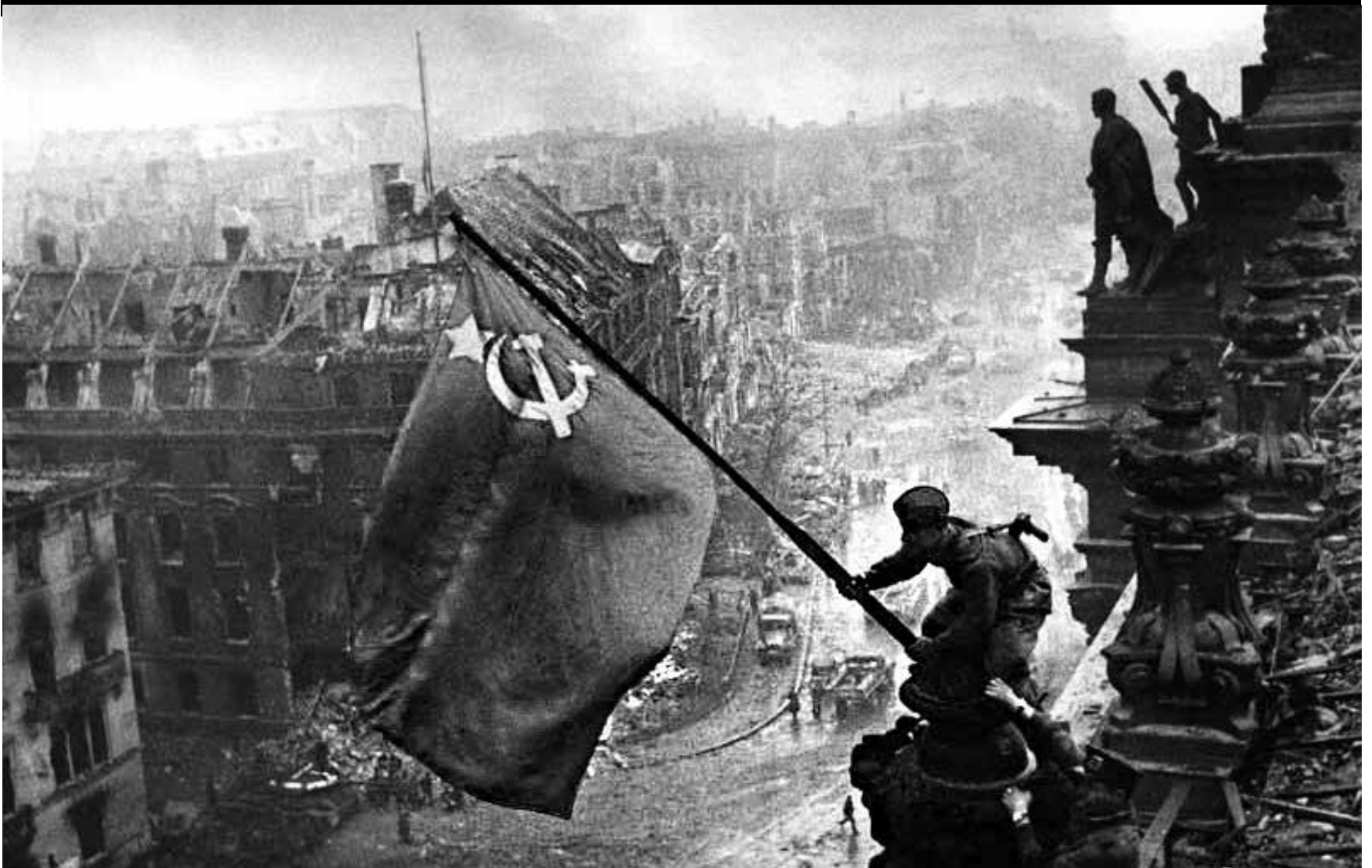
The Red Army plants the communist flag over Berlin's Reichstag building in May 1945. The Soviet Union under Stalin defeated the fascists in World War II. Celebrate the power of the working class at PLP's 50 anniversary this May Day (see backpage).